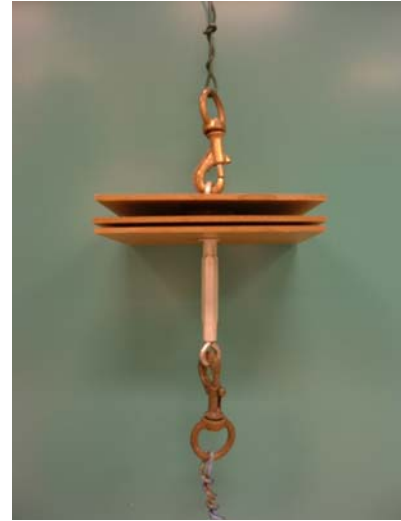
Figure 2 Multiplate Sampler

For monitoring large non-wadeable rivers in New York State, the specific method of biological sampling used by the Stream Biomonitoring Unit has remained unchanged since its inception in 1972. Multiplate samplers (multiplates), a type of artificial substrate sampling device, are used in flowing waters too deep for net sampling. Artificial substrates obtain a macroinvertebrate sample by providing a substrate for macroinvertebrate colonization for a fixed exposure period (5 weeks), after which the sampler is retrieved and the attached organisms are harvested. The use of artificial substrate samplers allows the comparison of results from different locations and times by providing uniformity of substrate type, depth, and exposure period. The sampler design is 3 hardboard plates, each 6 inches square, separated by spacers, and mounted on a turnbuckle (Figure 2). Samplers are usually suspended from navigation buoys or floats, at a depth of one meter.