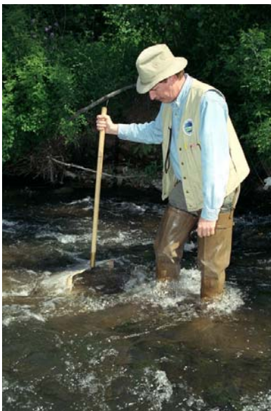
Figure 3 Kick Sampling

Our most upstream Genesee River sampling site in New York State is located in Shongo, 1.5 miles north of the Pennsylvania border. Water quality is assessed as non-impacted at this site, based on sampling in 1999 and 2004. The macroinvertebrate community is one typical of a high-quality stream, diverse and well-balanced, with many mayflies, stoneflies, and caddisflies. Moving downstream, sites in Wellsville and Scio have been assessed as slightly impacted in recent samplings. Nonpoint source nutrient enrichment is the primary cause of impact. In this reach, sensitive mayflies and stoneflies become less numerous, and more tolerant filter-feeding caddisflies become more numerous, feeding on suspended plankton. Continuing downstream, most sites in Caneadea and Cuylerville have been found to be non-impacted. Some of the largest of the clean-water macroinvertebrates, the formidable hellgrammites, are often found under stream rocks at these sites. Further downstream at Avon, water quality has been assessed as slightly impacted in all years sampled since 1974, likely from siltation and nonpoint source nutrient enrichment. The upper Genesee River has wadeable riffles, and the kick sampling method is used (Figure 3); downstream of Avon, multiplates are deployed by boat.